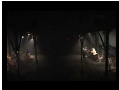
LANDED2 The Suspension Of Wait, Part One: Leaving