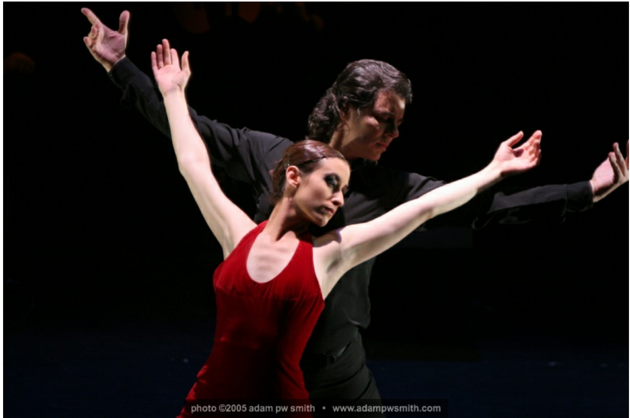
Festival La Otra Orilla