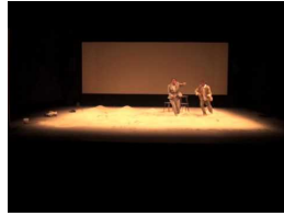
Caín&Caín, una creació de Eduard Fernández y Pep Ramis